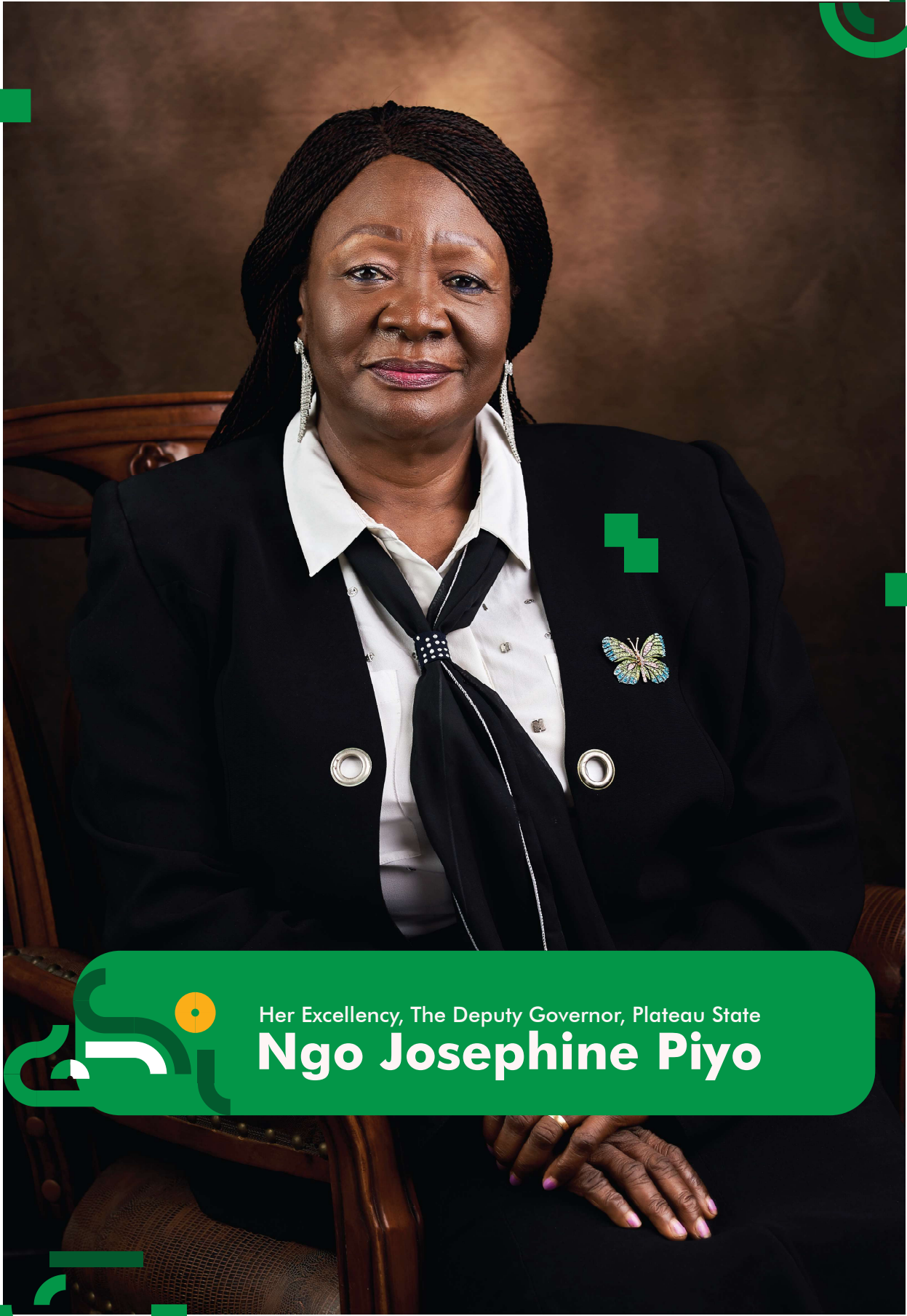
Her Excellency, The Deputy Governor, Plateau State Ngo Josephine Piyo